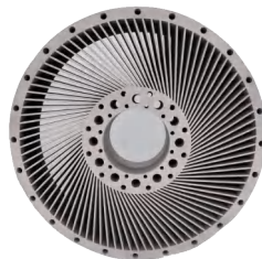
Impeller IN718 \phi 380 x 156 mm