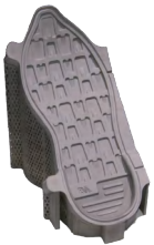
Shoe Mold Maraging Steel 255 x 155 x 280 mm